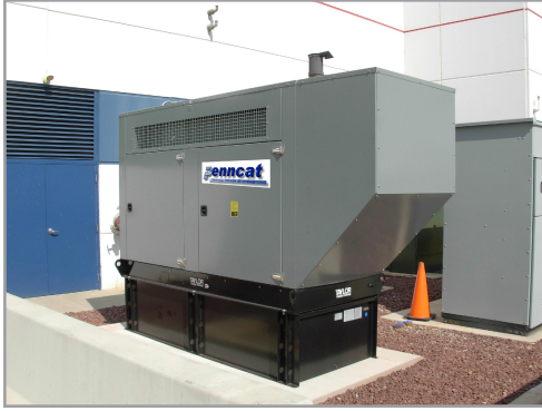
Shown with optional features.