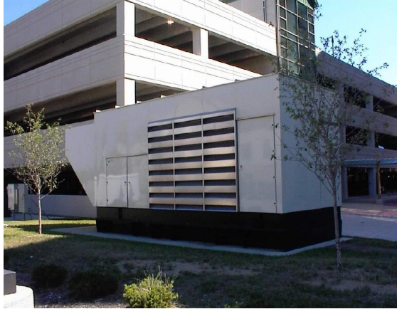
Shown with optional equipment.